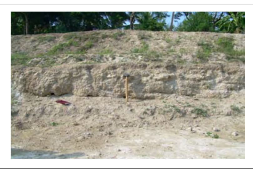
Figure 5: Saidarpet and Trichtrambalam Cross Road Bridge Section